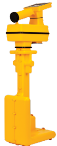
3M™ Dynatel™ iD Marker/EMS Tape Locator 7420