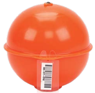
3M™ EMS Ball Marker Self leveling feature, suited for depths of 5–6'